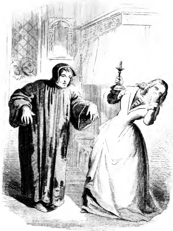
THE FRODOLOME PHYSICIAN